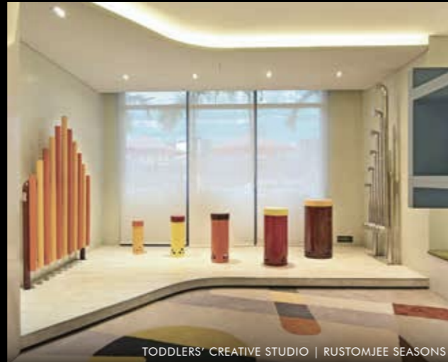
TODDLERS' CREATIVE STUDIO | RUSTOMJEE SEASONS