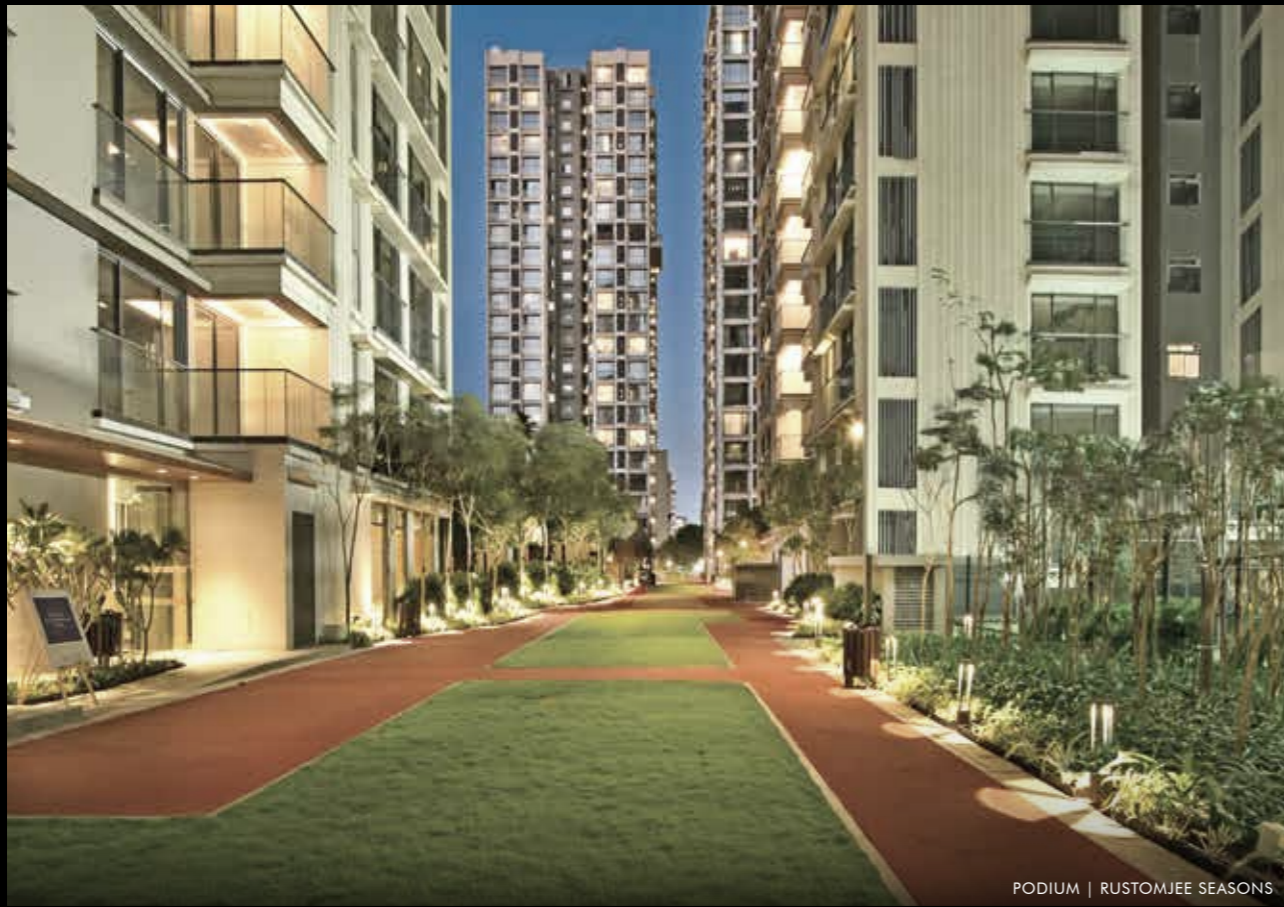
PODIUM | RUSTOMJEE SEASONS