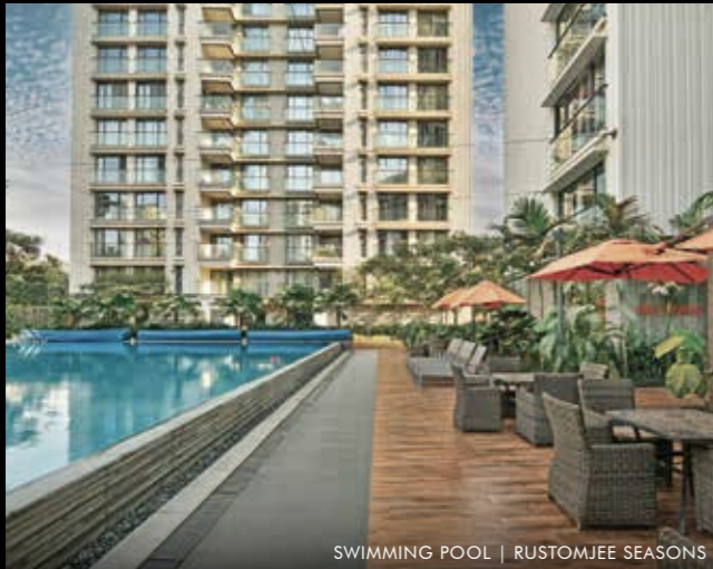
SWIMMING POOL | RUSTOMJEE SEASONS