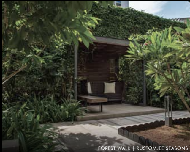
FOREST WALK | RUSTOMJEE SEASONS