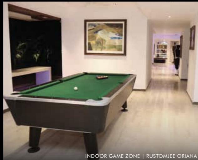
INDOOR GAME ZONE | RUSTOMJEE ORIANA