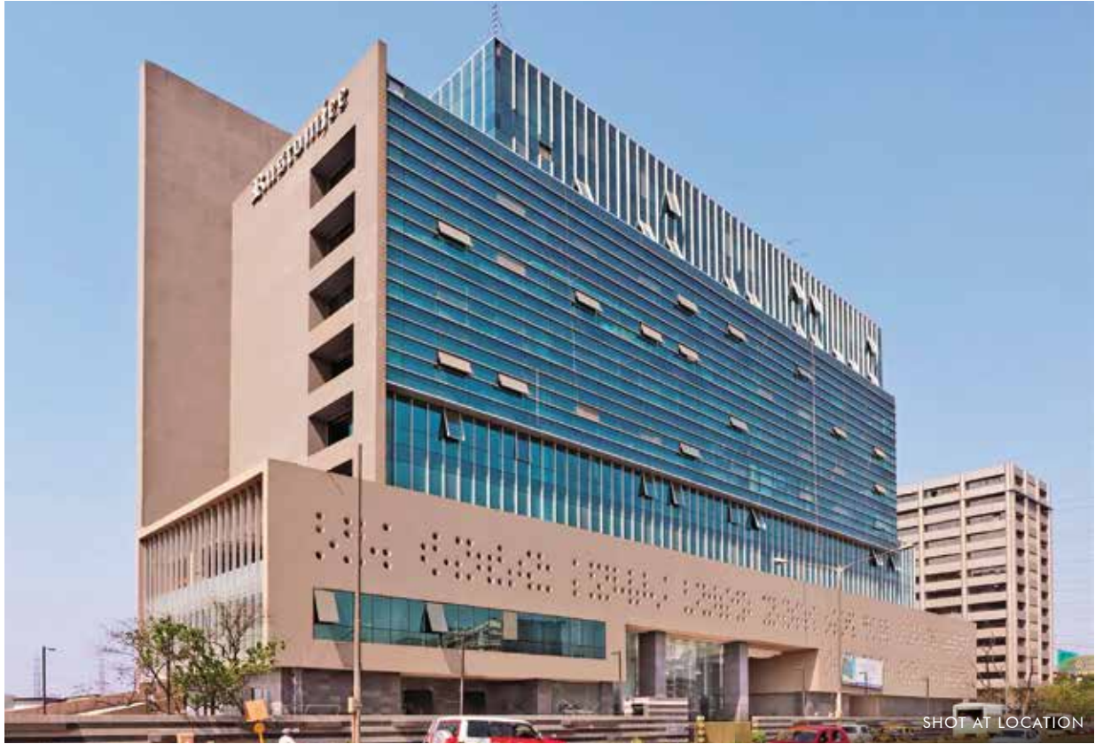
ASPIREE BY RUSTOMJEE (SION EAST)