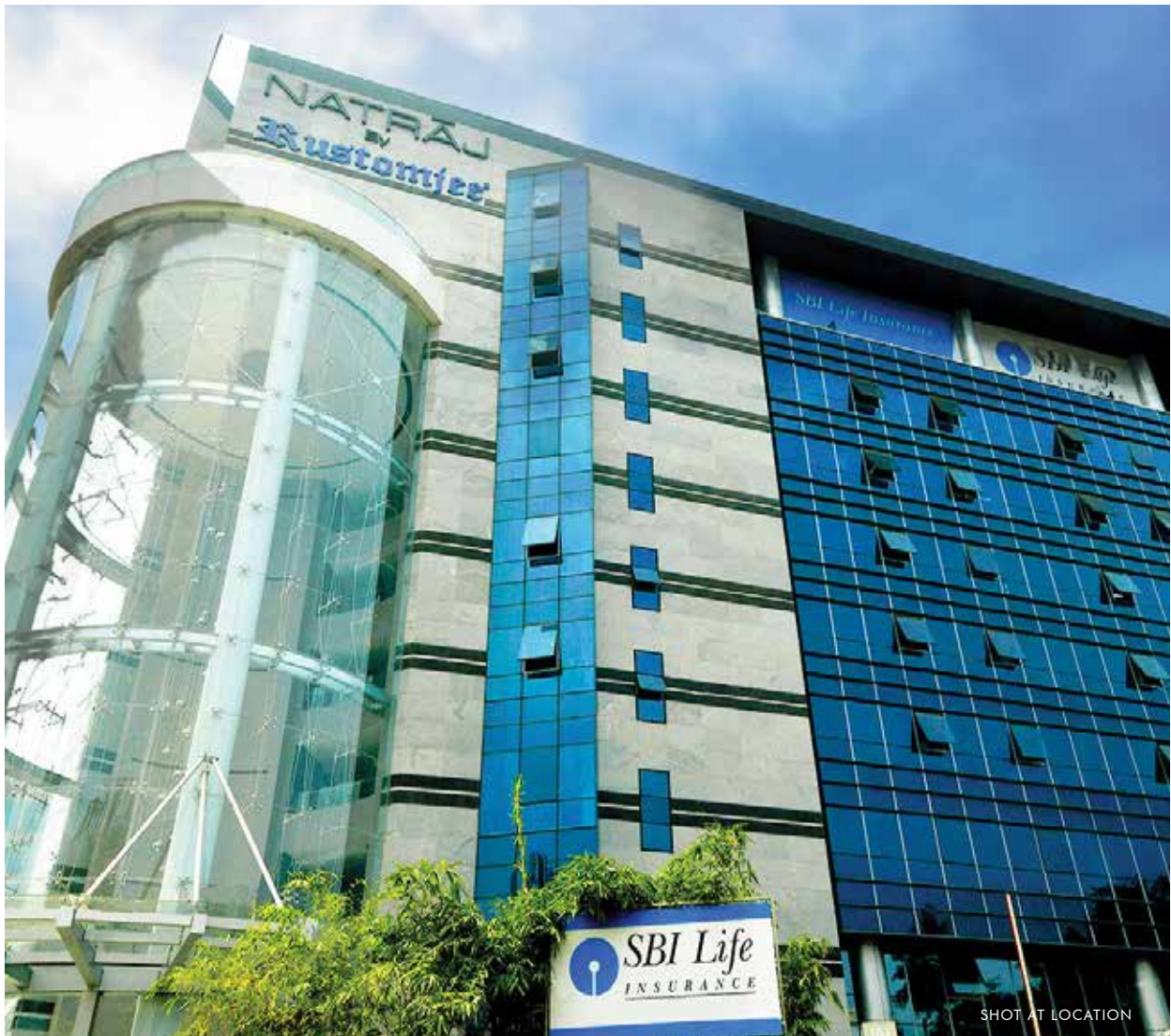
NATRAJ BY RUSTOMJEE (ANDHERI EAST)

Just a few landmarks that have made giving directions around town much easier.