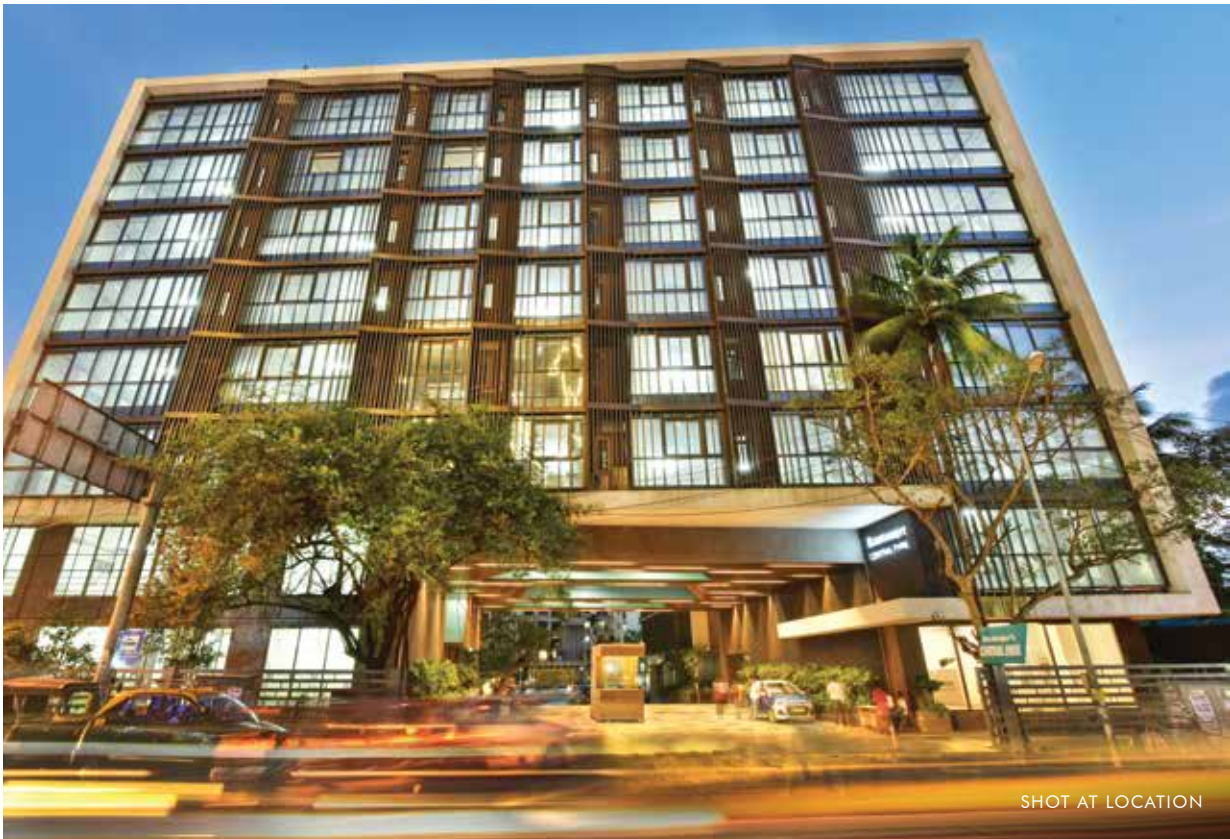
CENTRAL PARK BUSINESS SPACES (ANDHERI EAST)