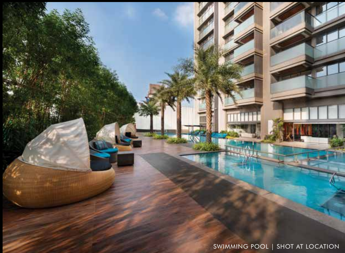
SWIMMING POOL | SHOT AT LOCATION

Spread over an expansive 1.65 acres in the heart of Khar West, Rustomjee Paramount is a signature high-rise complex designed to be a world unto itself. A world of incredible luxury and leisure. A world which invites you to live on your own terms in your own not-so-little world.