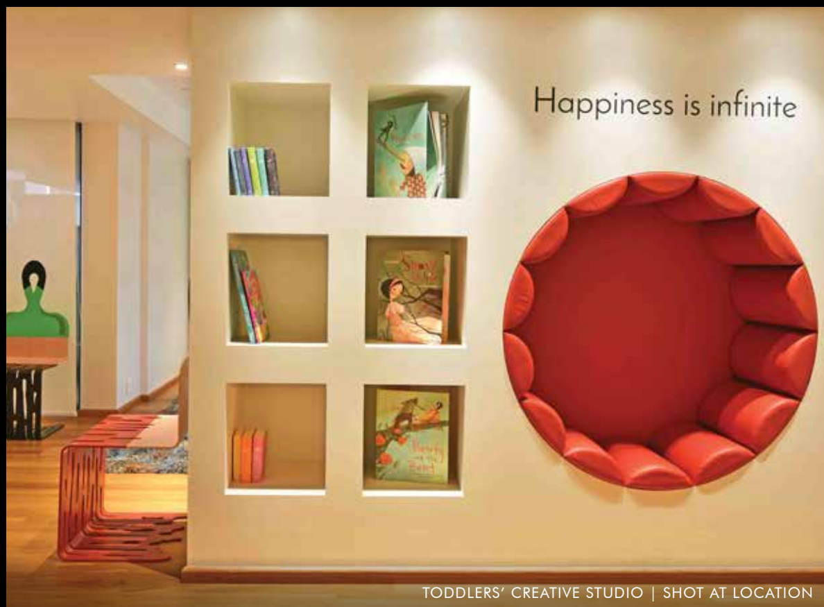
TODDLERS' CREATIVE STUDIO | SHOT AT LOCATION

From the Toddlers' Creative Studio to the Indoor Games Zone, a home at Rustomjee Paramount gives the kids a community where new friends and discoveries make growing up feel like a never-ending play date.