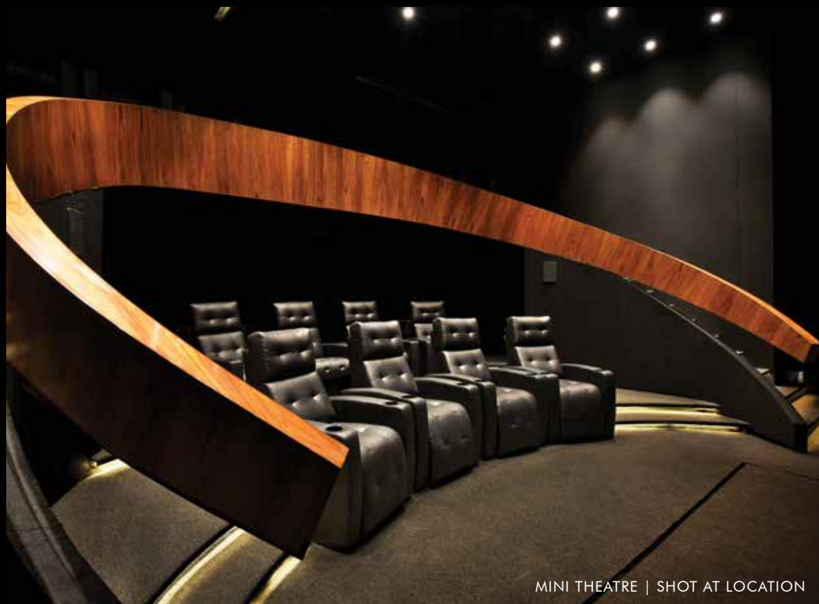
MINI THEATRE | SHOT AT LOCATION

FIBER TO HOME CONNECTION FOR HIGH SPEED WIFI