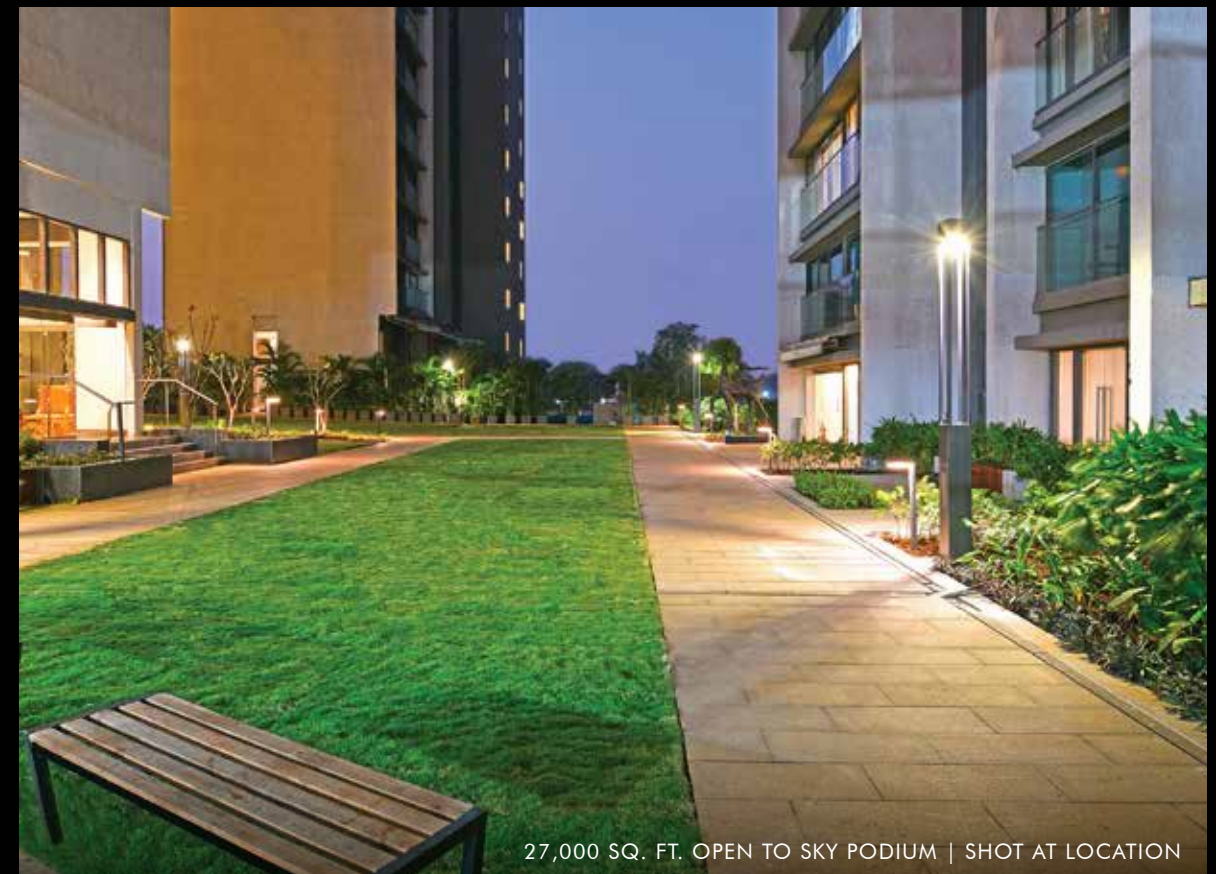
27,000 SQ. FT. OPEN TO SKY PODIUM | SHOT AT LOCATION

CNN Time Out has listed Bandra West as one of the world's coolest neighbourhoods. Ranked alongside London's Soho, and LA's Downtown. The good news is a home at Rustomjee Paramount is just a short stroll away from the bustling streets, charming heritage architecture, and the hottest pubs, cafes and restaurants of Bandra West. What's not to love?