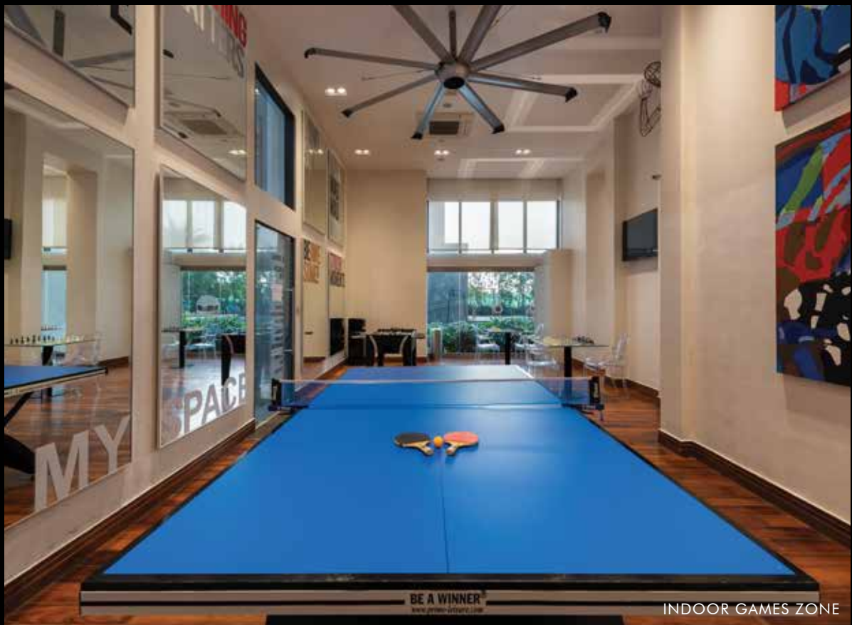
INDOOR GAMES ZONE