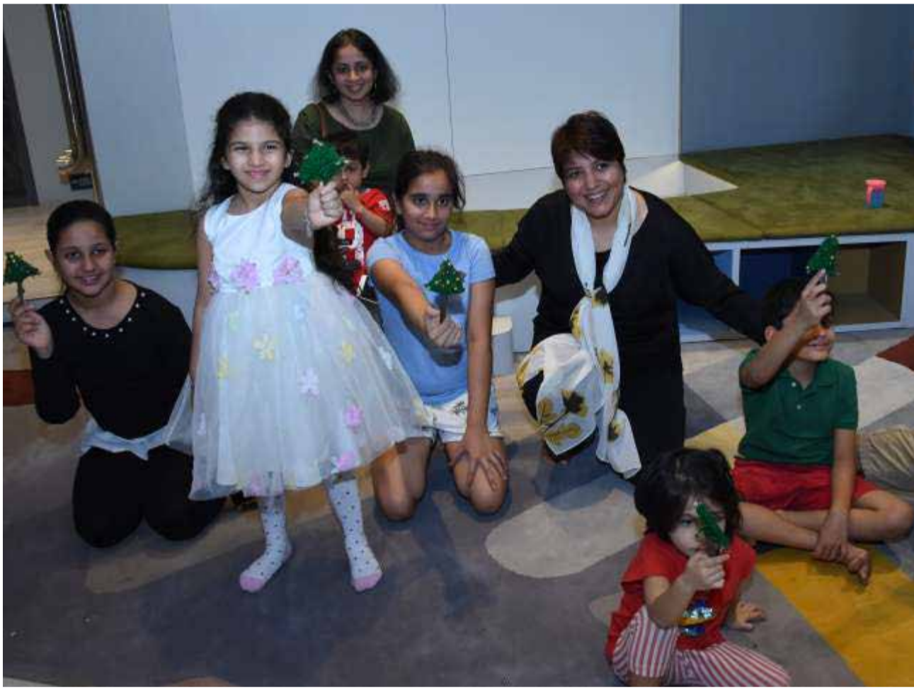
Nothing like a good old Christmas Day celebration to uplift spirits and spread some festive cheer.