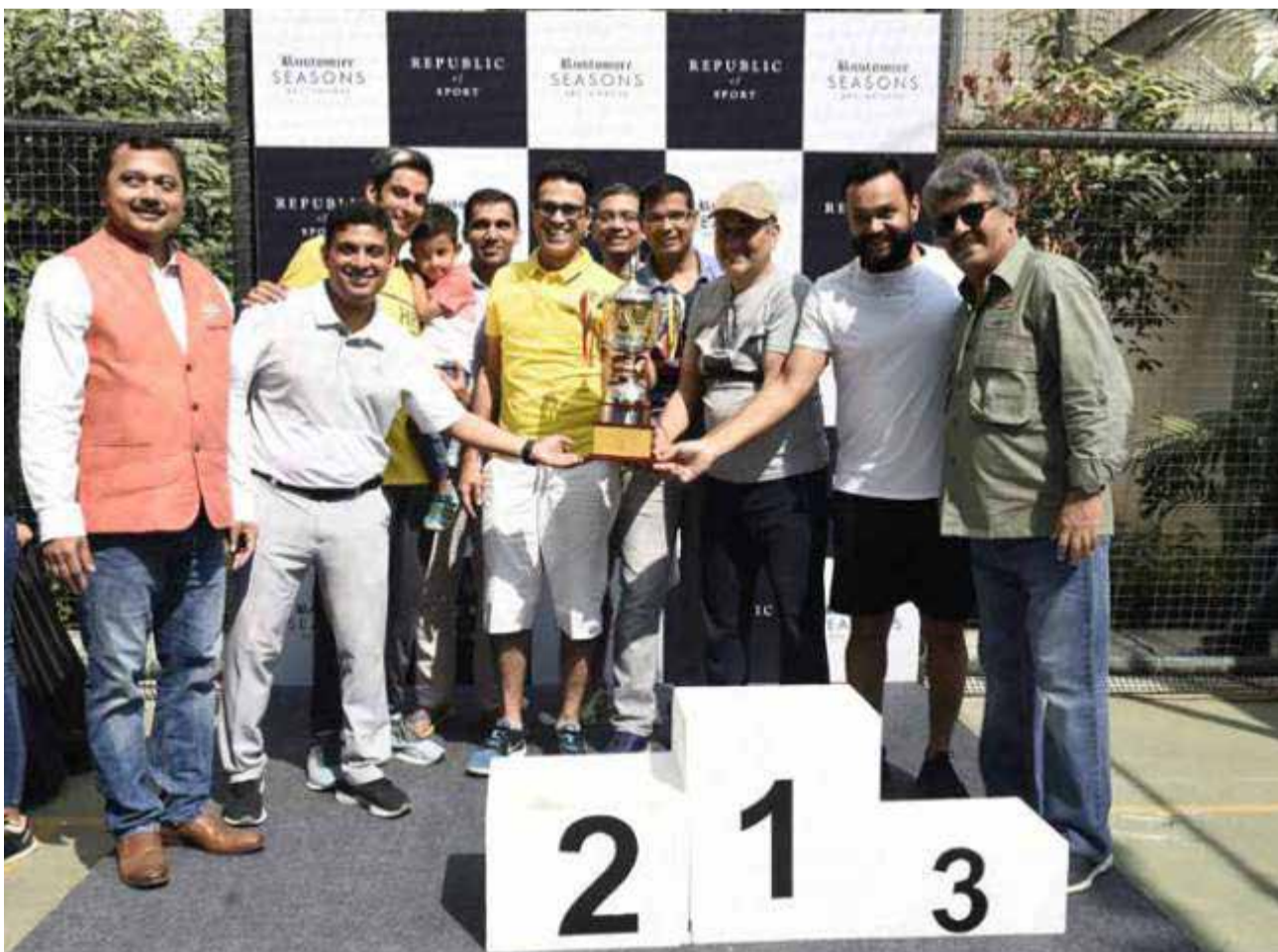
The residents of Rustomjee Seasons had an exciting day packed with sports, games, cheering and little wins to remember.