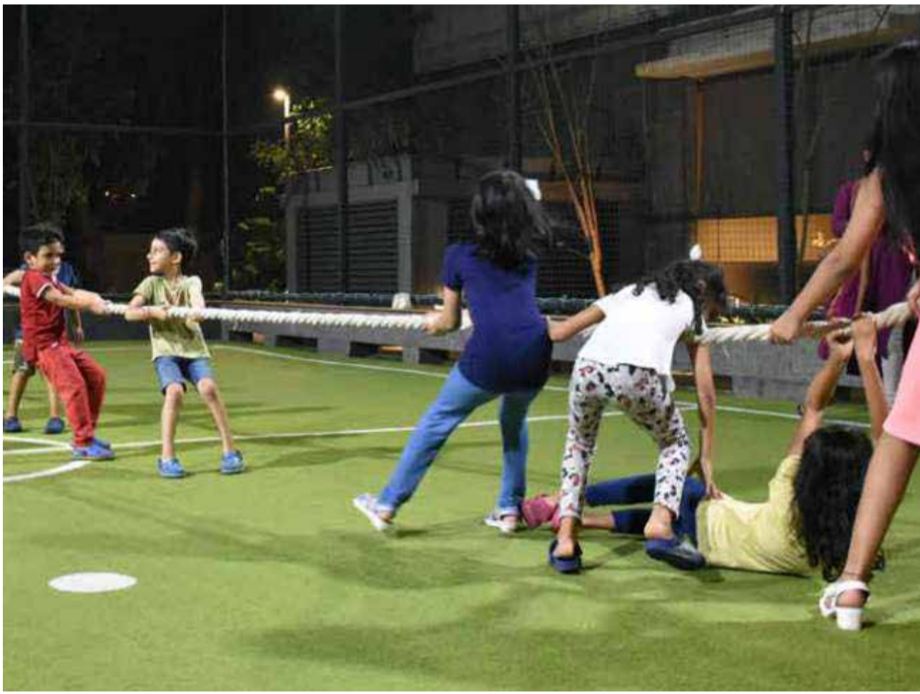
Children's Day was celebrated with fun games and activities. It was a great hit with the little crowd.

Life here makes sure there are no dull moments. Every occasion turns into a grand celebration and fun is just a way of life. Here are some highlights from the activities that kept this community tightly knit and happy in their own cocoon.