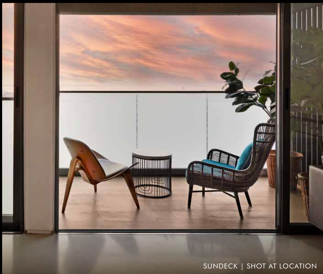
SUNDECK | SHOT AT LOCATION

Even more so in one of the city's most coveted neighbourhoods – Khar West.